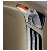
Prairie Gold Metallic